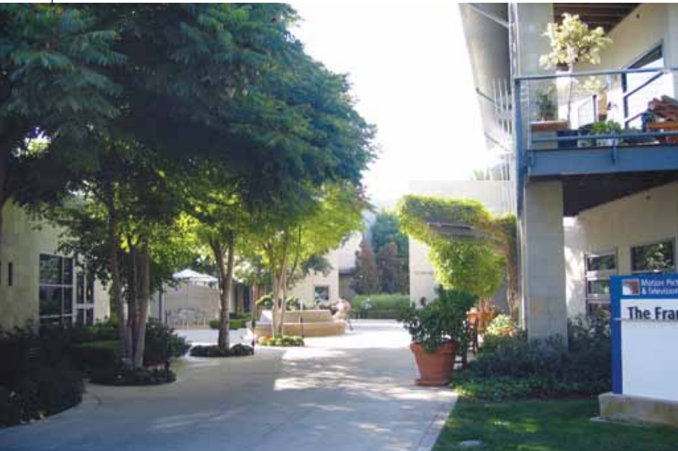
As designed by SmithGroupJJR, each of nine distinct garden spaces support resident wellness at the Fran and Ray Stark Assisted Living Villa in Woodland Hills, California (Motion Picture & Television Fund).

their homes, such as wider doorways, curbless showers, grab bars in the bathroom, and a floor plan that can be easily navigated. RDL Architects typically designs their senior living communities to meet accessibility guidelines, whether they are required by code or not, says Meltzer.