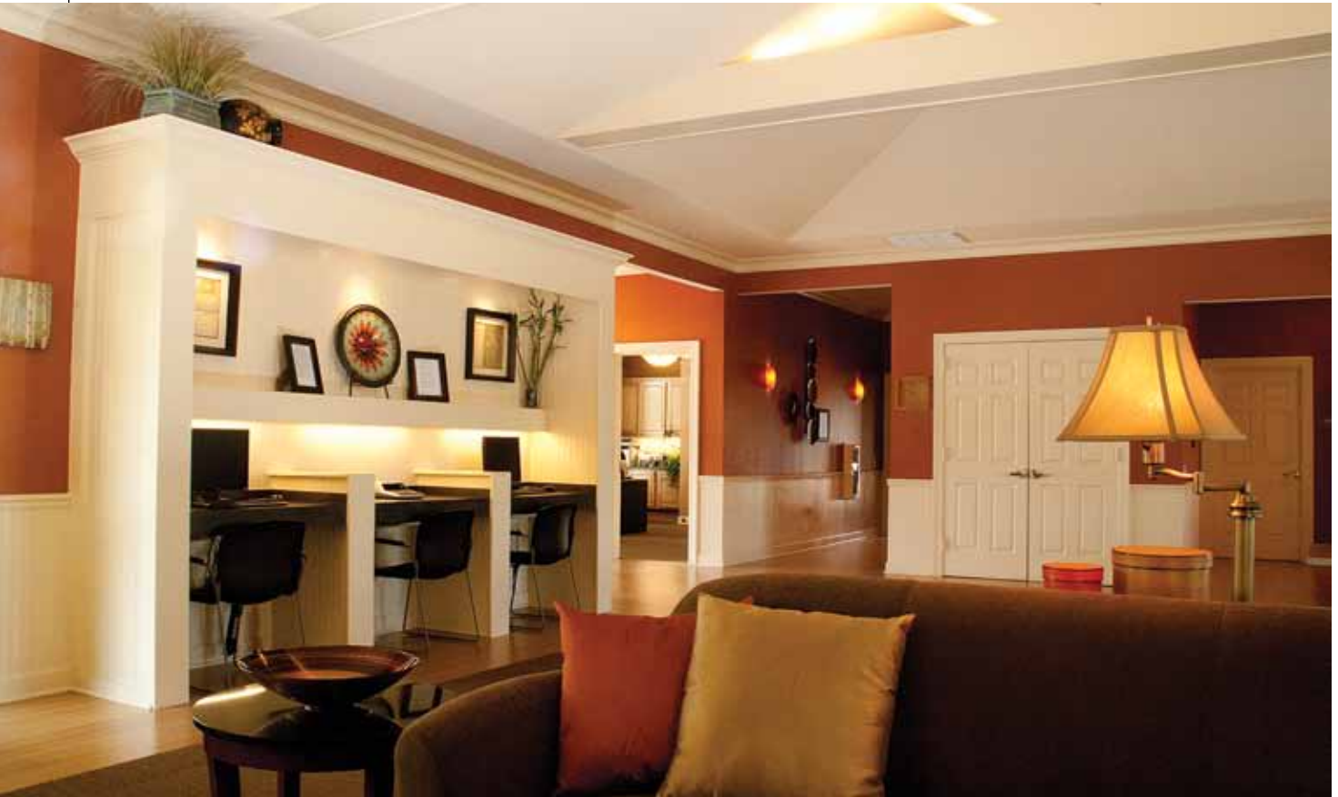
At North Central Village Senior Apartment Homes in Columbus, Ohio, interior public spaces were designed by RDL Architects to provide opportunities for engagement. Purposefully designed spaces, such as computer stations within the Great Room, provide opportunity for social interaction through incidental use.

views and access to the outdoors,” she says. “Windows that look out on the courtyard encourage residents to connect with nature. Plantings and outdoor structures can also make outdoor seating/gathering areas feel more intimate.” Transitional elements, such as porches or other covered outdoor structures, allow for ease of movement even during inclement weather, Meltzer adds.